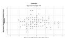
Figure 1. Heteroscedasticity Test (Main Test)

Heteroscedasticity test is one part of the classical assumption test in the regression model. To detect the presence or absence of heteroscedasticity in a data, it can be done by looking at the Scatterplot graph on the SPSS output. The test results can be seen in the following image: