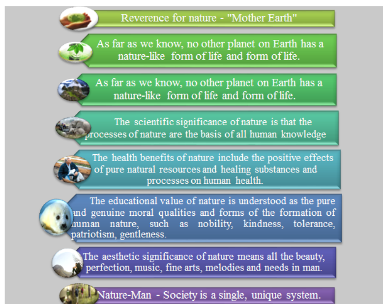
Figure 1. Principles that shape environmental knowledge

Source: Author's development based on the collected data.