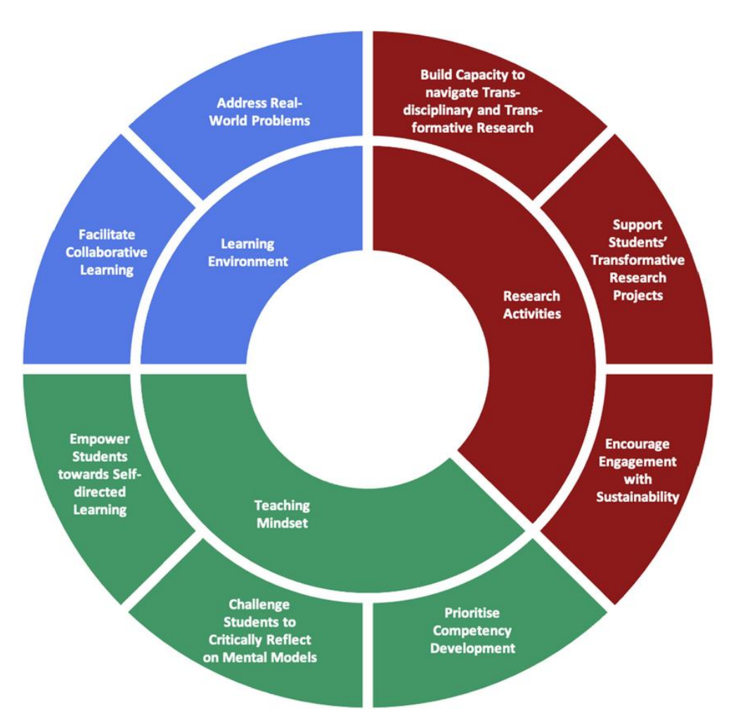
Figure - 1: Environment Development and Sustainability

A significant number of universities have implemented environmentally sustainable practices such as energy conservation, waste management, and sustainable campus infrastructure. Case studies from institutions like the University of California, Berkeley, and Yale University demonstrate the adoption of green technologies such as solar panels, green roofs, and energy-efficient buildings. However, while these initiatives have become more common, environmental sustainability is often seen as a standalone objective rather than integrated into the broader strategic vision. [17, 18, 19]