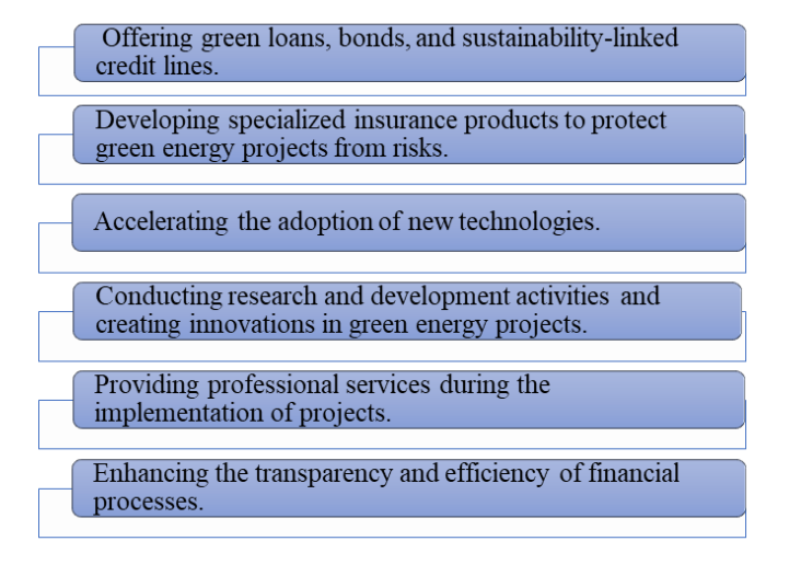
Table 2. Advantages of establishing the "Bank-Tadbirkor" cooperative for service enterprises<sup>3</sup>.

As presented in Table 2, the SWOT analysis of Bukhara region reveals key strengths and vulnerabilities. Moreover, it is recommended to promote the implementation of solar water heating systems in new buildings by introducing the appropriate amendments in the section "Construction Norms and Regulations." Having worked in this area, I know that installing a solar water heating system in the initial construction phase of a new building will bring down the cost massively. Unfortunately, the new technologies can only be properly applied if we have the right knowledge and skills. It is crucial to develop specialists in renewable energy, including engineers, technical staff and project managers.